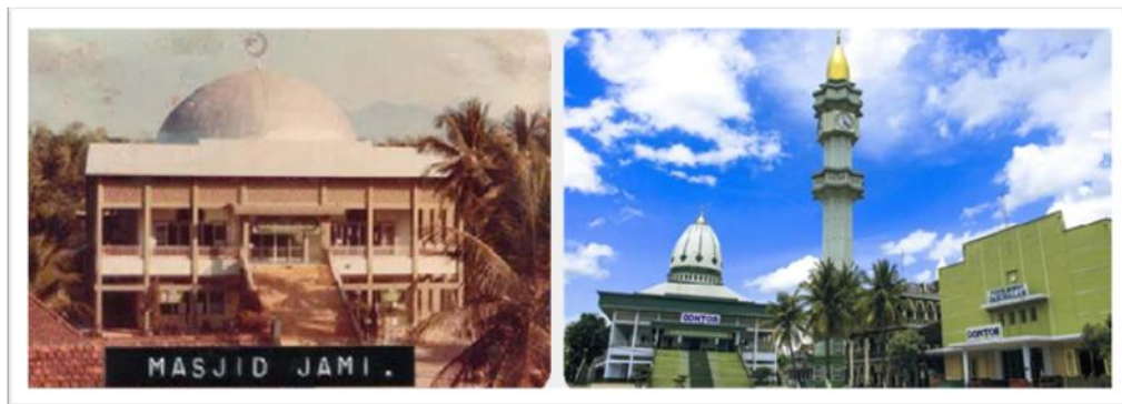
Figure 1. Gontor past and present

The study's findings suggest a unique concept of accountability tailored to the conditions and culture of the research location. This study suggests that the accountability framework consists of two fundamental categories: vertical and horizontal. Vertical accountability focuses primarily on the Waqf Board. Due to the relative seniority of the members, the report is intended to make it simpler for them to comprehend the accountability report, eliminating the need for them to utilize various sophisticated software. Vertical accountability is only designed to cater to stakeholders other than the Waqf Boards. It merely enables them to observe and evaluate the development of a property based on their sensory perception.